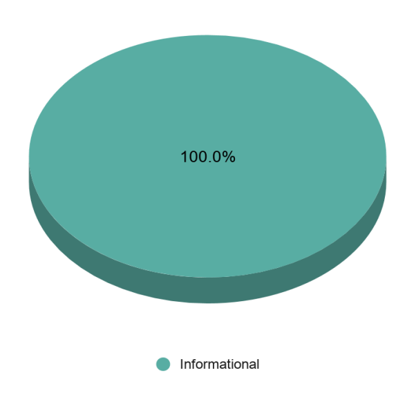
Graph 1. The distribution of vulnerabilities after the first review.

This document is proprietary and confidential. No part of this document may be disclosed in any manner to a third party without the prior written consent of Hacken.